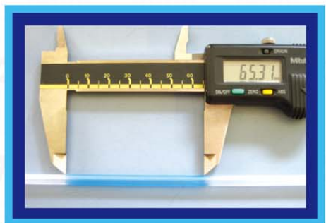
間欠押出チューブ Total Intermittent Extrusion