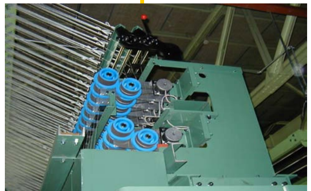
Working Needles width 170 inches 120 Roll Servo

Manufacture Nakagawa Seisakusyo Co. Ltd. Sole Agent Yamaguchi Sangyo Co. Ltd.