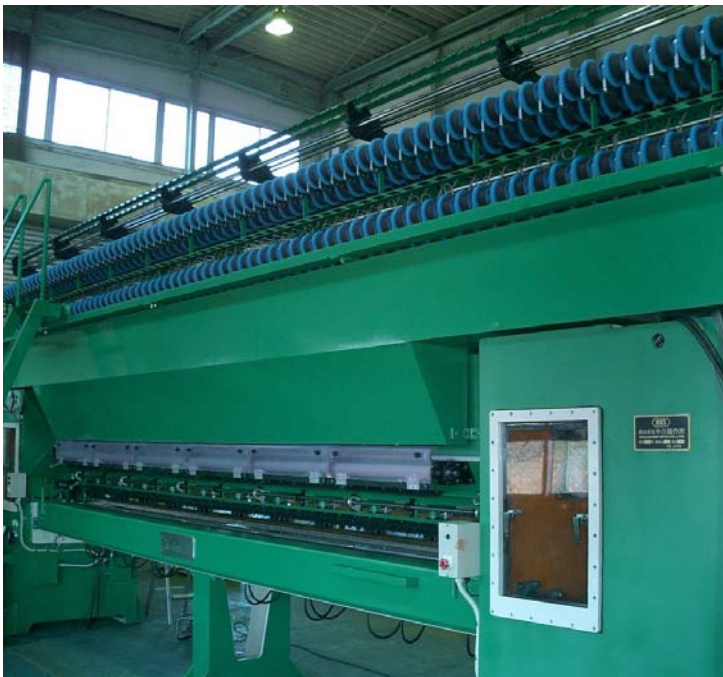
144 Rolls Stepping Motor With PCL Tufting Machine