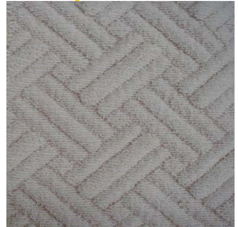
120 Rolls Servo 1 / 8" GG Loop Carpet

Number of Rolls : 120rolls, 144rolls, 240rolls, ... Number of Gauges : 1 / 1 0"GG. 1 / 8"GG. 5 / 3 2"GG. ... Design Repeat : Number of Rolls x Number of Gauges