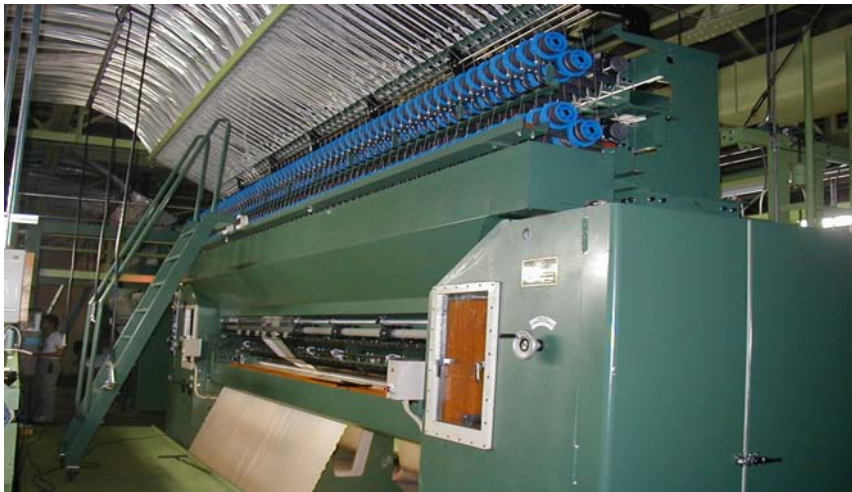
Working Needles Width 170 inches 120 Rolls Servo Tufting Machine